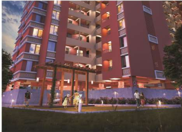
Club House Multipurpose Court Commercial Space